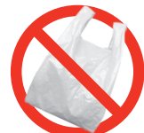
NO Plastic Bags