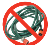
NO Garden Hoses