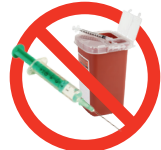
NO Medical Waste