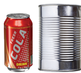
CANS Aluminum & Steel