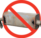
NO Scrap Metal