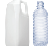
PLASTIC Bottles & Jugs, 1, 2 & 5