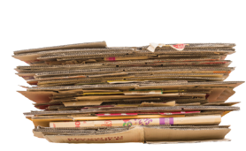
CARDBOARD Dry & Flattened, No Food Contact