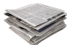
NEWSPAPER Clean & Dry