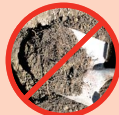
Dirt & Stones