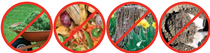
Dirt & Stones